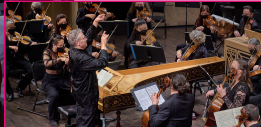
Philharmonia Baroque Orchestra p. 4