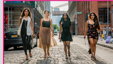
Excelsis Percussion Quartet p.6