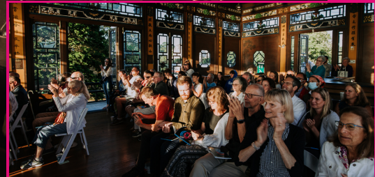
FULL FESTIVAL SCHEDULE INSIDE!