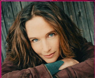
Hélène Grimaud p. 3

NEWPORT CLASSICAL MUSIC FESTIVAL, EST. 1969