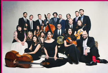
The Knights p. 6