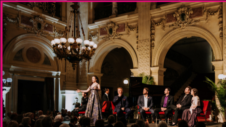
Opera Night: Così fan tutte p. 2